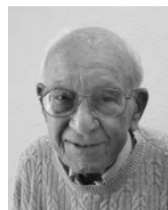
Under 3000 Al Nadel