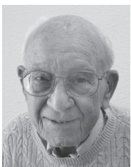
Open Al Nadel